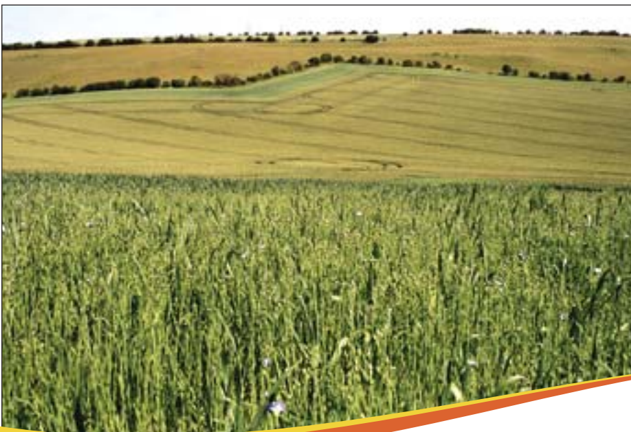
Good brood-rearing cover for grey partridges.

Cold, wet weather after hatching also leads to lower levels of chick survival and small brood sizes. Again, insect-rich brood covers can mean that when the weather improves, a plentiful supply of food is readily available and the effects of bad weather on chick survival can be minimised. We cannot control poor British summer weather, but we can provide chicks with the best chances of survival by providing abundant food in easy reach.